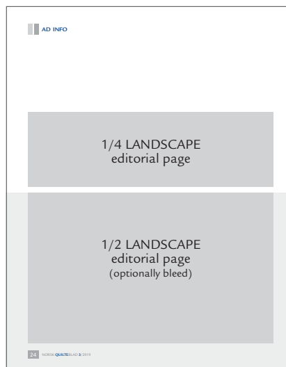
MISCELLANEOUS AD FORMATS EDITORIAL PAGES

Please send ads preferably as pdf's ready to print. When ads are created or modified by the printing company, the additional cost will be invoiced by NQF.