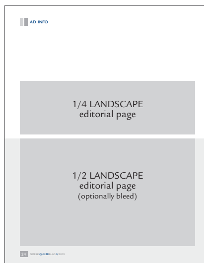
MISCELLANEOUS AD FORMATS EDITORIAL PAGES

Please send ads preferably as pdf's ready to print. When ads are created or modified by the printing company, the additional cost will be invoiced by NQF.